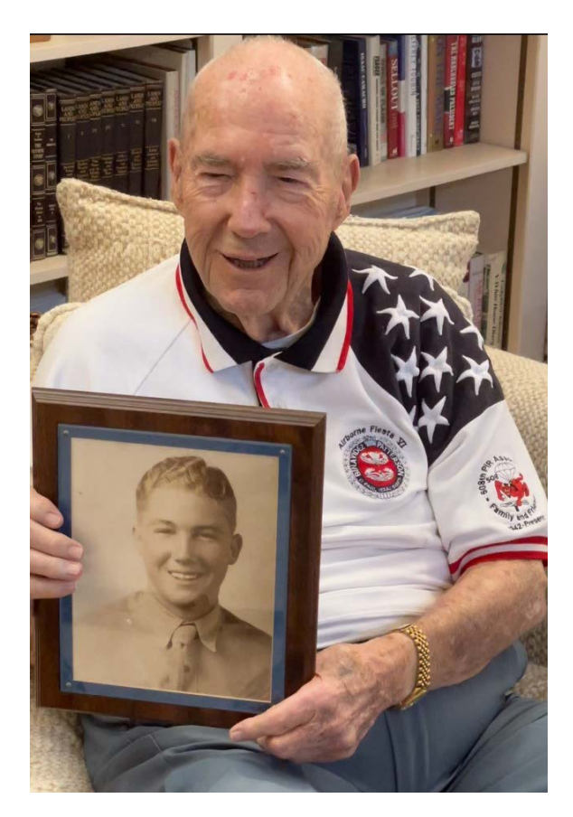
Anthony, New Mexico – October 2021